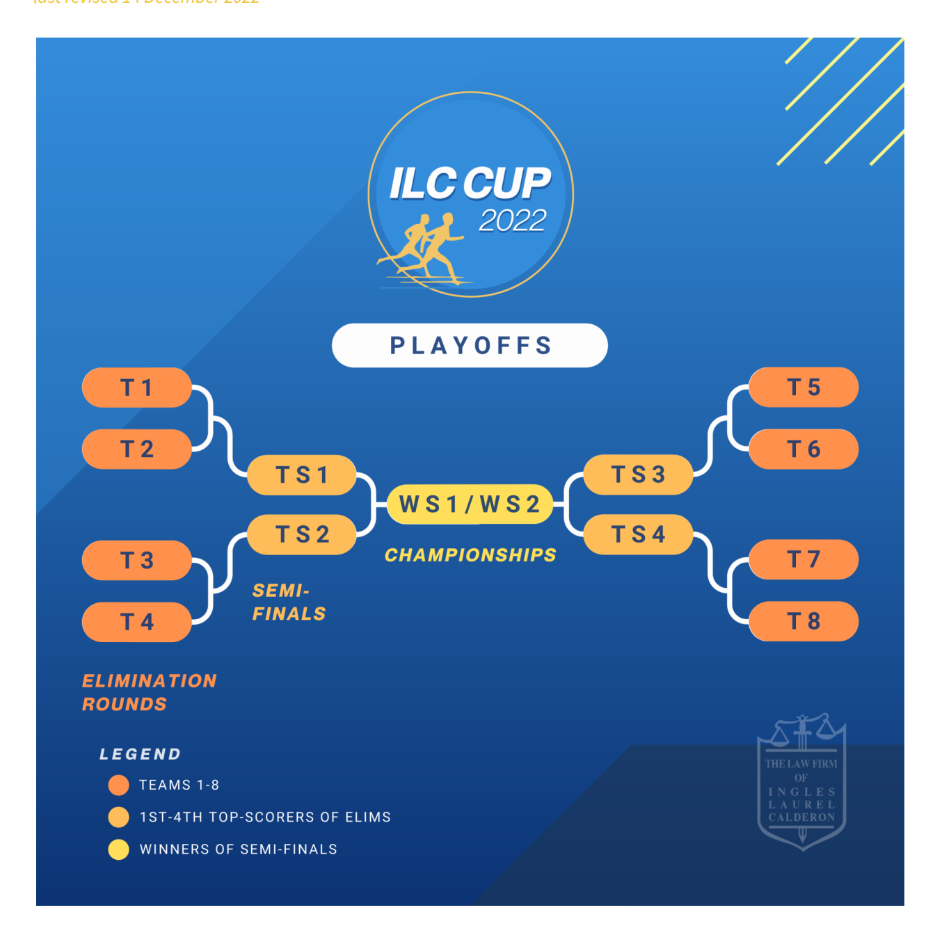
Article 16. General Procedures

Each Oral Round consists of sixty (60) minutes of oral pleadings. Applicant and Respondent are, in principle, each allotted thirty (30) minutes. Oral presentations must be made by two (2) members from each team. Prior to the beginning of the Oral Round, each team must indicate to the bailiff how it wishes to allocate thirty (30) minutes among: (a) its first oralist, (b) its second oralist, and (c) rebuttal